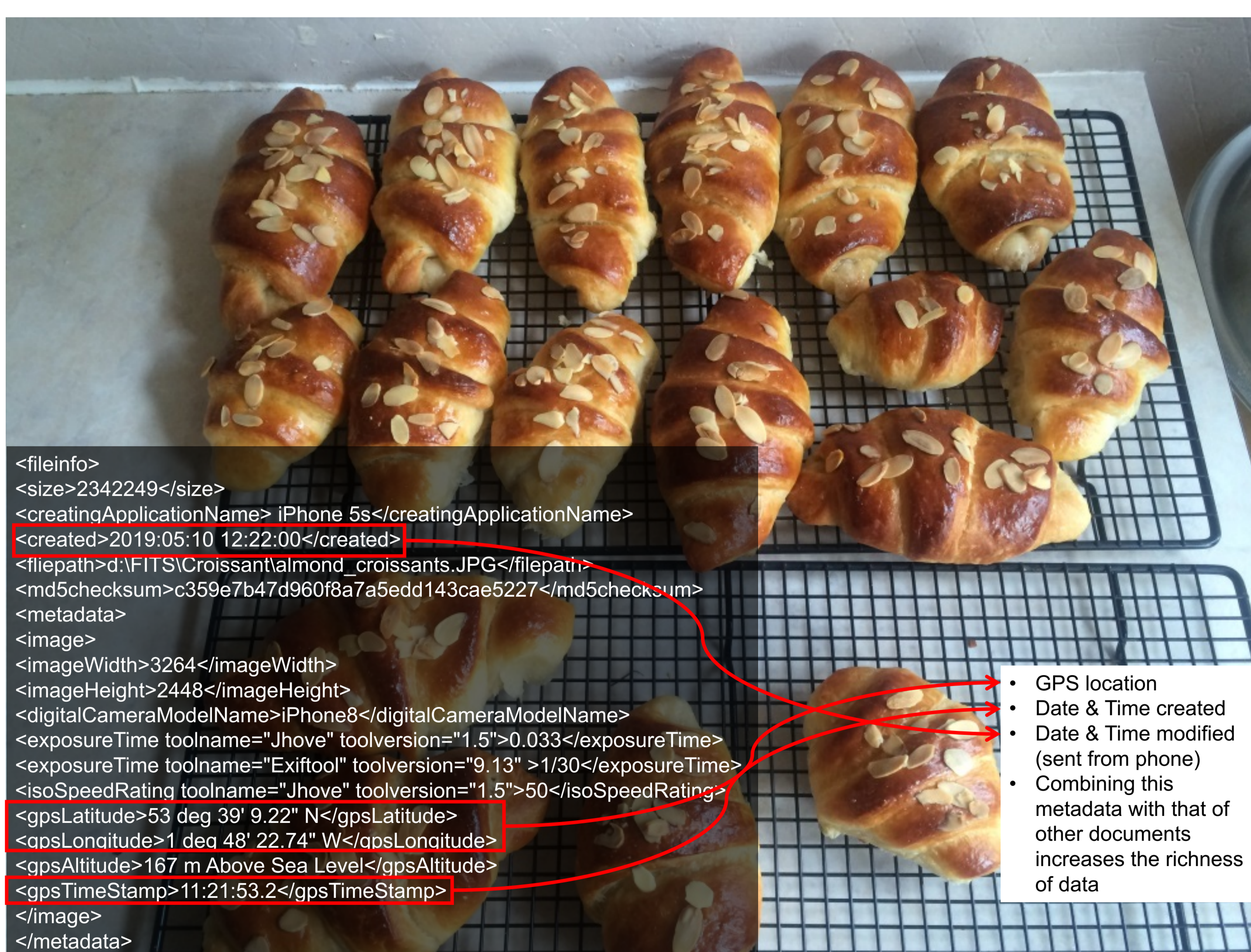
Example of documentation for donors